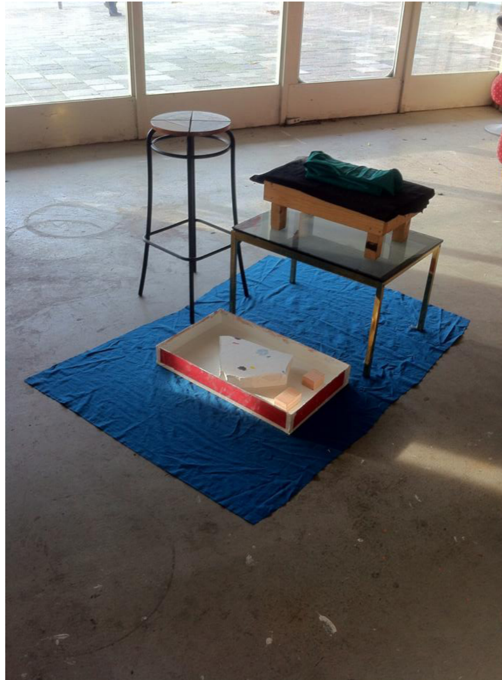
directory of determinations